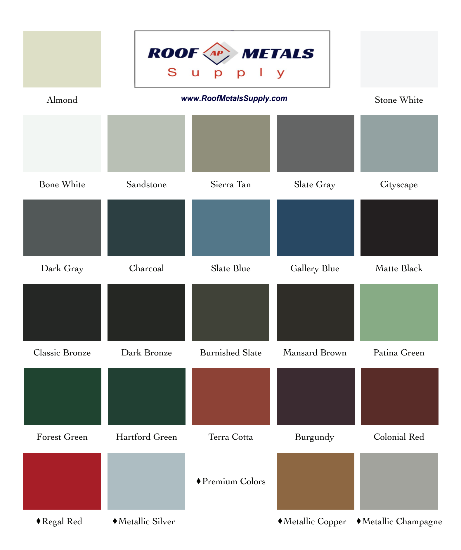
PLEASE NOTE: The colors listed on this color chart are as close to the actual painted metal as possible. Actual color swatches are available upon request. Fluropon® pre-finished galvalume steel and aluminum containing Fluropon® 70% PVDF.